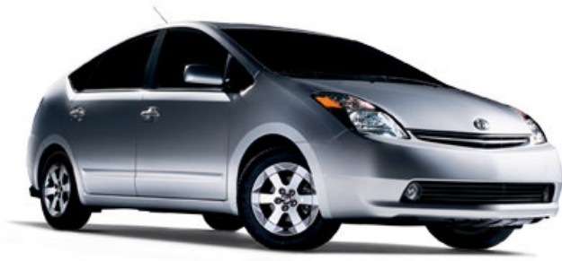
Prius in Millennium Silver Metallic with available Package #9

4-Door Gas/Electric Hybrid (1224) MSRP* Starting At: $21,725.00